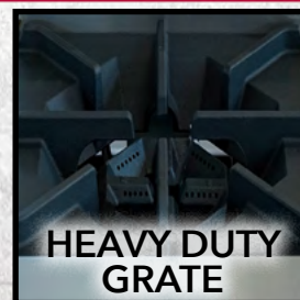
HEAVY DUTY GRATE