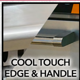
COOL TOUCH EDGE & HANDLE