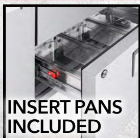
INSERT PANS INCLUDED