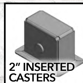
2" INSERTED CASTERS