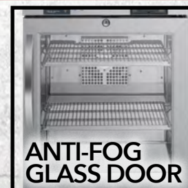
ANTI-FOG GLASS DOOR