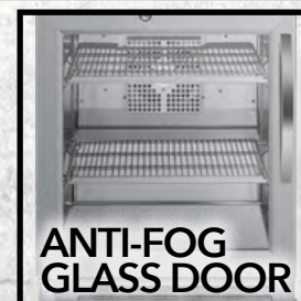
ANTI-FOG GLASS DOOR