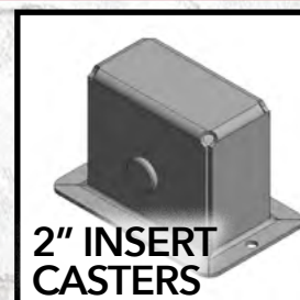
2" INSERT CASTERS