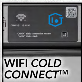
WIFI COLD CONNECT™