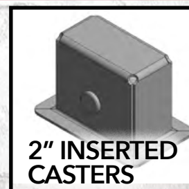
2" INSERTED CASTERS