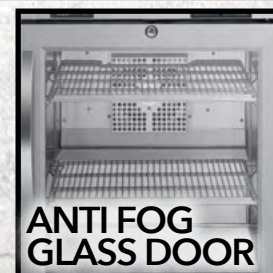
ANTI FOG GLASS DOOR