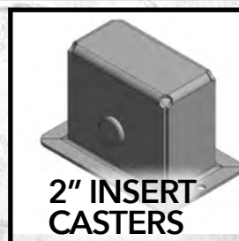
2" INSERT CASTERS