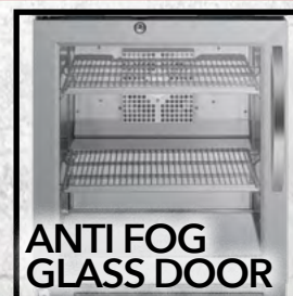
ANTI FOG GLASS DOOR